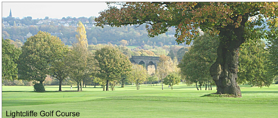
Lightcliffe Golf Course